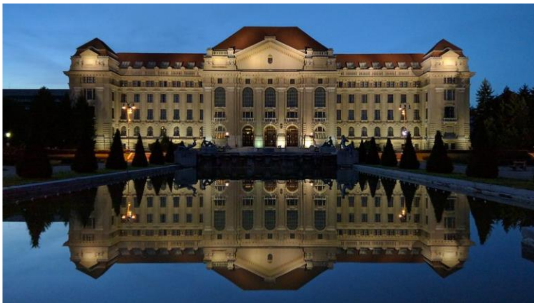
Main building of the University of Debrecen

Cellular ceramic and polymeric materials for defence and military applications- A review