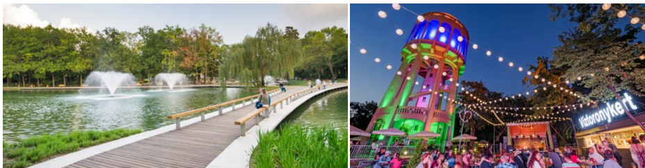
Lake Békás and Water Tower, Debrecen