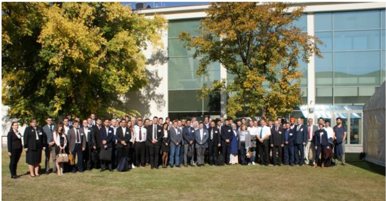
A group of ISCAME Participants in 2018

12:30 – 12:45 ISCAME group photo (meeting at the inner court)