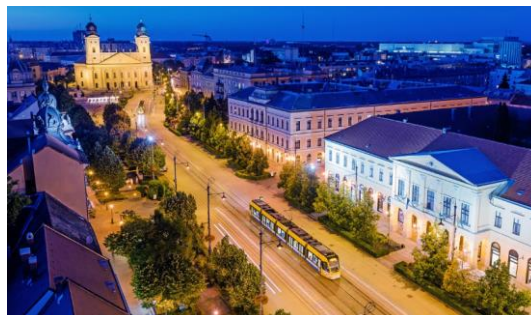
City Centre, Debrecen